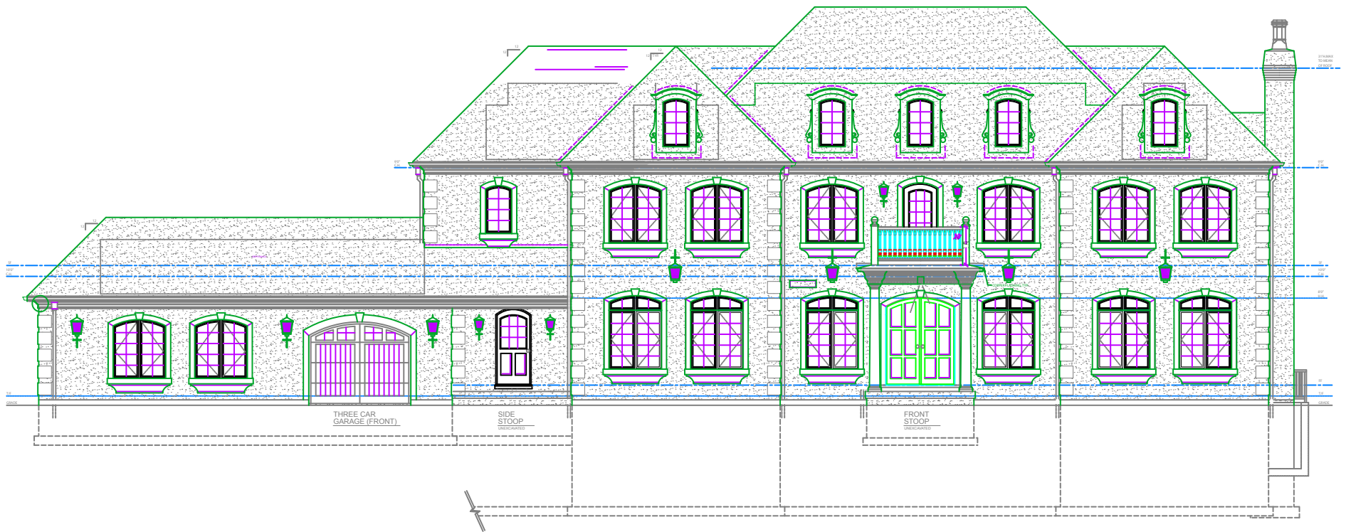
FRONT ELEVATION - WEST