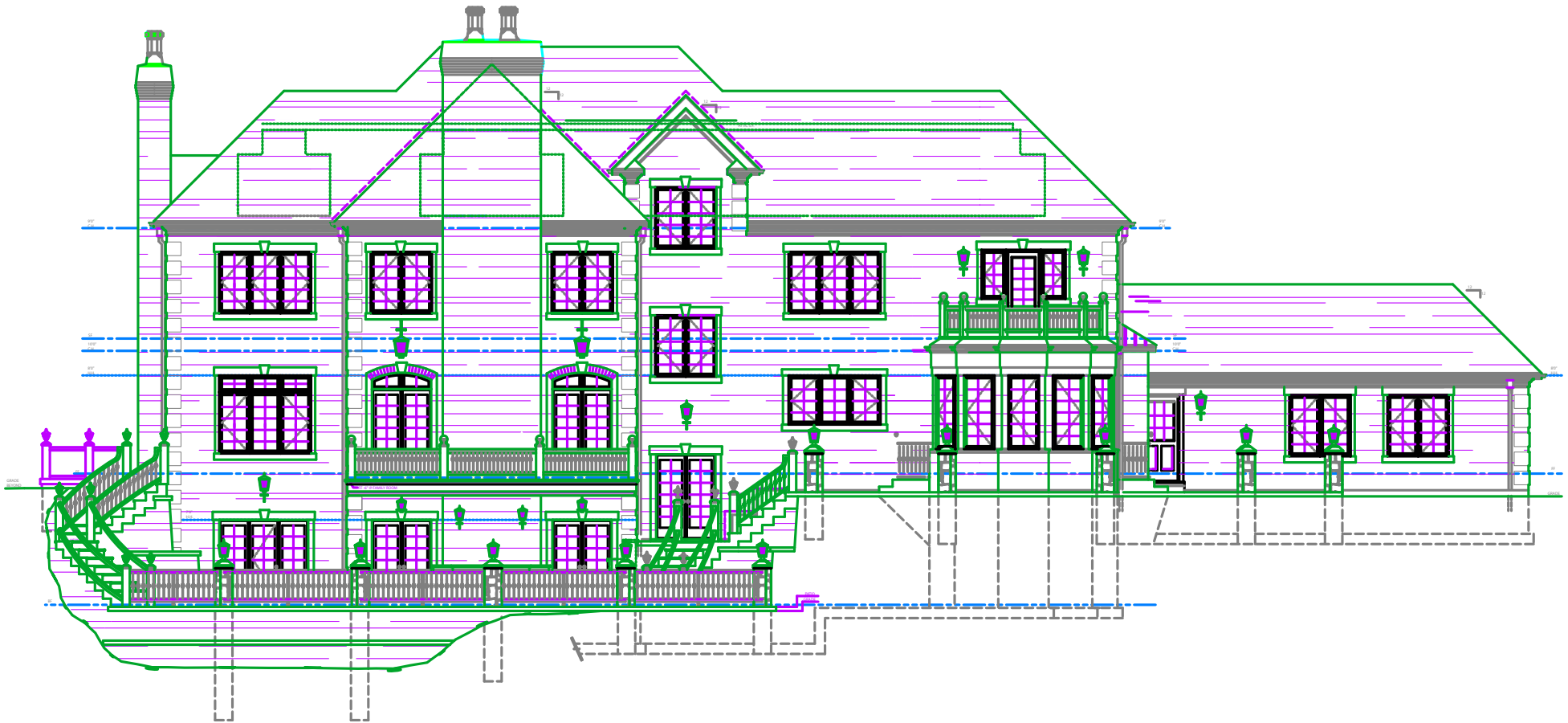
REAR ELEVATION - EAST